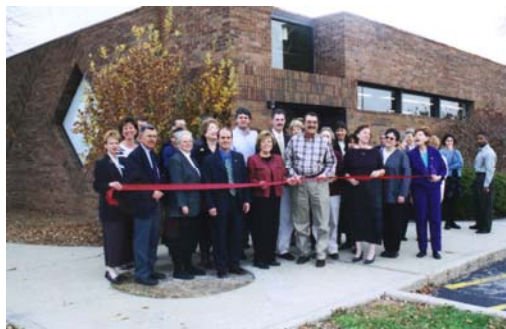
M.E.R.C.Y. Communities Grand Opening of the Furniture Store October 13, 2001